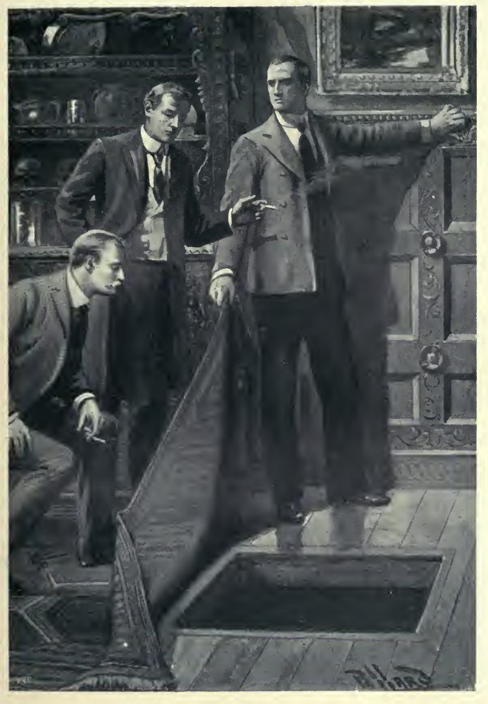
"He pressed a spring in the wall."